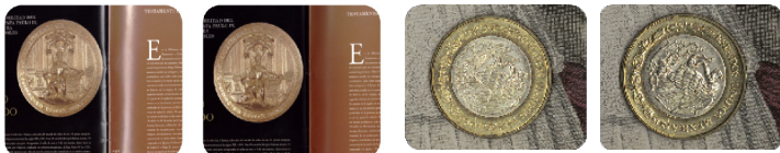
GLARE CONTROL SYSTEM